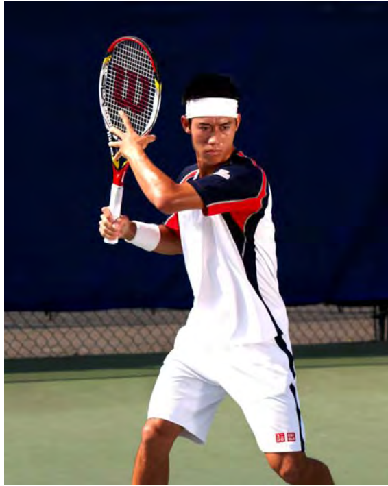
Above: Kei Nishikori with his Steam

Nishikori, the first Japanese player to reach the quarterfinals of the Australian Open since 1932, said: "This is the most advanced racket I have ever used. It clearly helped me late last year when I was able to beat some of the world's top players."